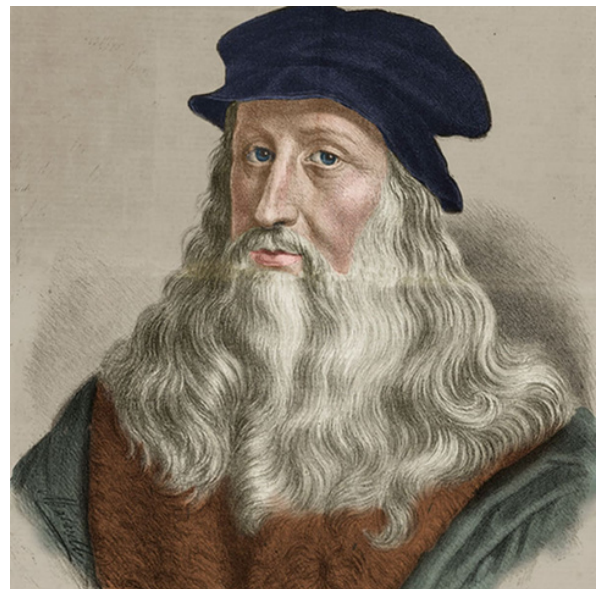
Leonardo da Vinci (1452-1519)

The epitome of the Renaissance man, Leonardo da Vinci was an accomplished musician as well as a master painter. He sang in addition to playing the lyre and the flute, frequently at gatherings of the nobility and at his patrons' palaces. His surviving manuscripts include some of his musical compositions for flute too.